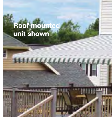
Roof mounted unit shown